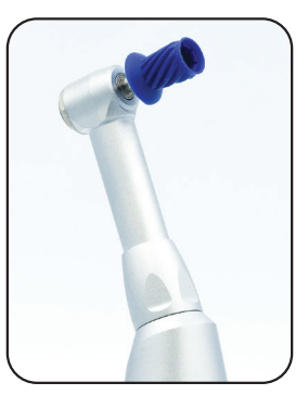
Polishing Program Suitable for all finishing, and polishing strips and discs with RA shank (2,35mm contrangle).