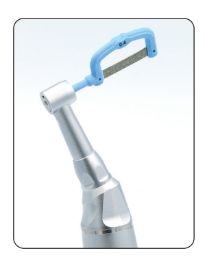
IPR Program Suitable for DentaSonic DiaStrip, and all automatic strip on the market today